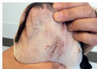
Photo 6 – Close-up view of the ventral surface of the head. Note the onset of a submandibular lesion