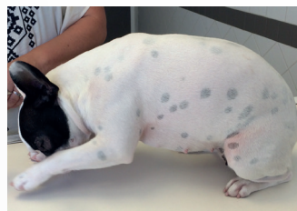
Photo 4 – Overview of the animal. Note the onset of a lesion in the stifle fold.

After the first month of follow-up, a deterioration in the dermatosis was observed, together with worsening of the blepharitis, cheilitis, inflammation of the pinnae and lesions in the large folds, and the onset of erythematous crusted lesions on the chin together with an increase in hair loss (photos 4 to 7). Additional skin tests were carried out but were unremarkable. No external parasites were observed. Lixy did not generally eat the food with enthusiasm, but it was digested well. In order to comply with the trial conditions, and to determine the role of the food versus a possible seasonal increase in environmental allergens, a joint decision was reached between the owner and the dermatologist not to intervene medically with respect to this unfavourable progression. The diet change trial was continued.