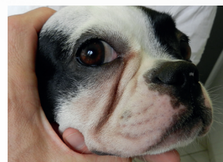
Photo 9 – Rostral view of the head. Note the reduction in the erythema.