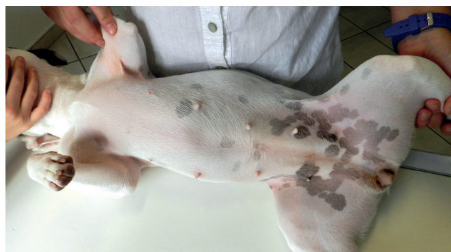
Photo 10 – Overview of the ventral surface. Note the clinical cure