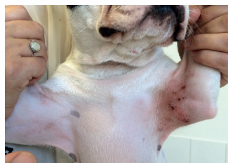
Photo 5 – Overview of the ventral surface of the thorax. Note the worsening of the axillary lesions