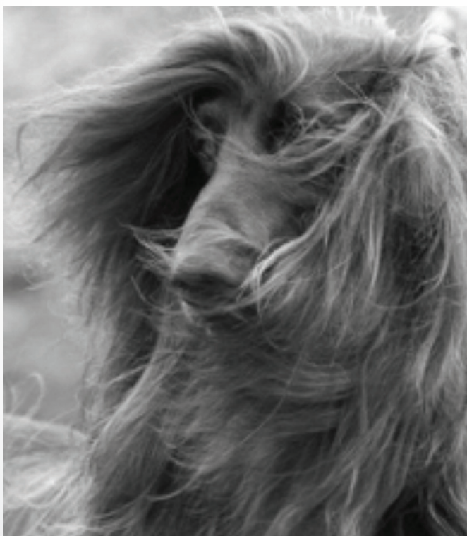
Photo 4 - Rashid Ebn Hugo Von Haussman at Myhalston after eating Canine Dermatitis DRM