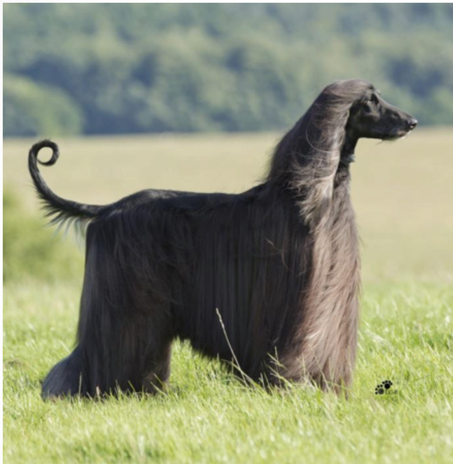
Photo 3 - Rashid Ebn Hugo Von Haussman at Myhalston after eating Canine Dermatitis DRM

Also not only did the diet help his coat, but his muscle condition too. Rashid is shown all over Europe and has to be in excellent body condition (Photo 3 & 4).