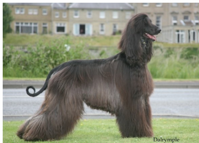
Photo 2 - Rashid Ebn Hugo Von Haussman before eating Canine Dermatitis DRM